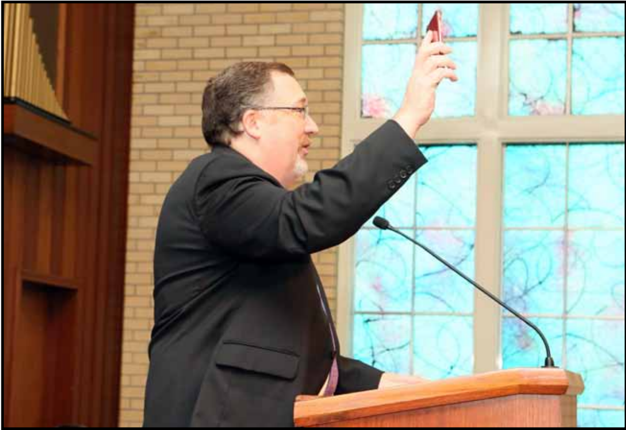
Nurturing Worship in Word and Spirit Individual, Family, and Corporate